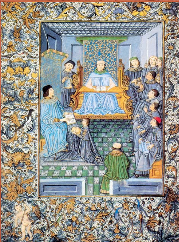
Antonio de Nebrija giving a Latin lesson in the presence of D. Juan de Zúñiga.

The great importance that Spanish has in our University is evident from the first time you hear the name "Antonio de Nebrija", in honor of the great humanist and the first person to describe the grammar of the Spanish language. Nebrija's Gramática castellana was published in 1492.